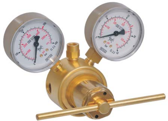
Line pressure regulator LT2000-300-25-NFG