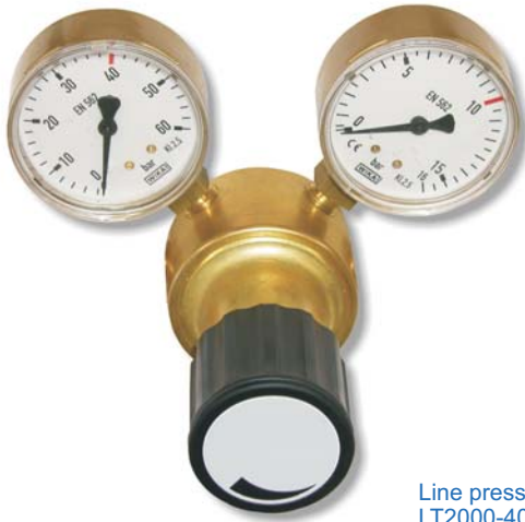
Line pressure regulator LT2000-40-10-NFG